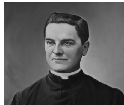
Blessed Father McGivney